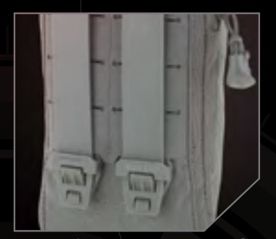
TacTie® Polymer Joining Clips Exterior Paracord Loop U.S. and Int'l Patents Pending