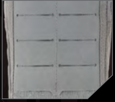
TPU-840D Nylon Composite Attachment Backing