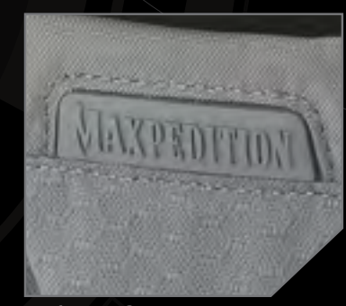
Refined Construction with Elegant Inlays