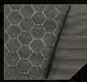
Dual Nylon Fabric Construction 500D Hex Ripstop/ 1000D Plain Weave