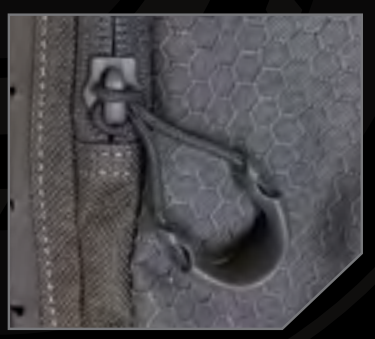
YKK® Zippers with Positive Grip Zipper Pull